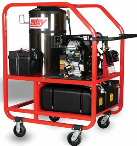
1270SS (shown with optional Portage Kit)

Hotsy-designed Triplex pumps carry a 7-year limited warranty and Heater coil carries a 5-year warranty.