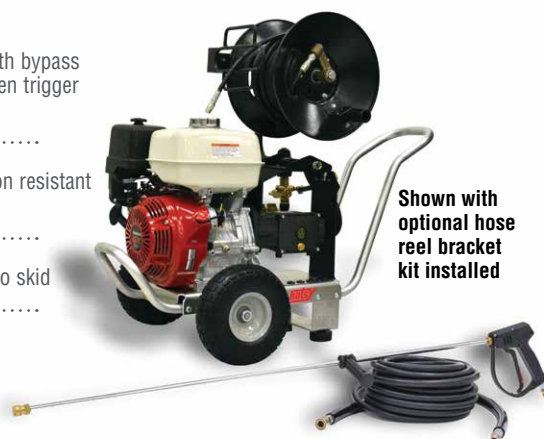
Shown with optional hose reel bracket kit installed