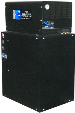
ES543K472A 5.4 gpm @ 3000 psi max.