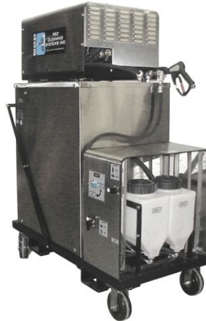
ES543K472AS - 5.4 gpm @ 3000 psi with optional stainless steel wrap, cart and dual chemical system