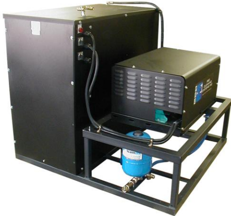
ES830K2472AS - 8 gpm @ 3000 psi with optional SRA surge relief assembly