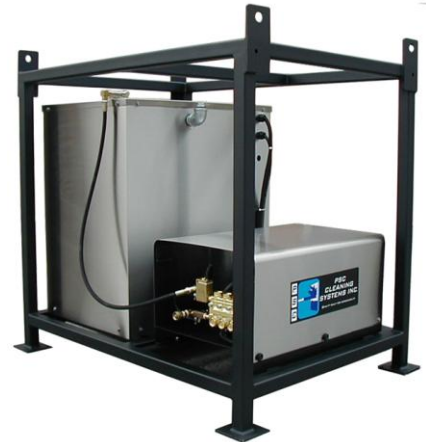
ES420K448AS - 4 gpm @ 2000 psi with optional stainless steel wrap and heavy-duty lifting skid